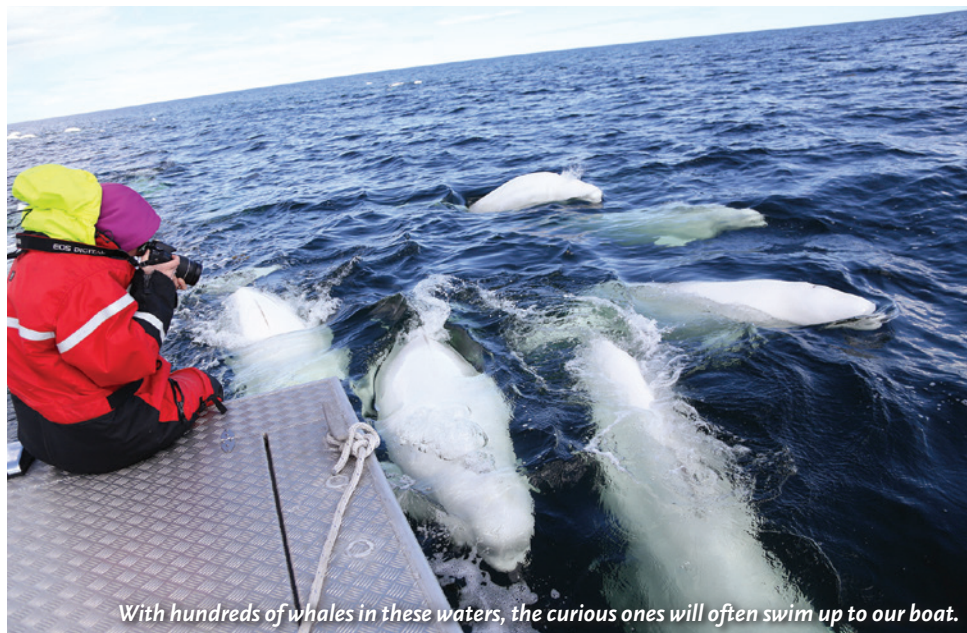
With hundreds of whales in these waters, the curious ones will often swim up to our boat.

Later today, join other guests for a Dog Carting adventure. Riding behind a team of energetic sled dogs is a terrific way to appreciate the beauty of the countryside and to experience a slice of Manitoba life. You'll also learn how the dogs are trained and gain insight into the local dog-mushing culture. MEALS B+L