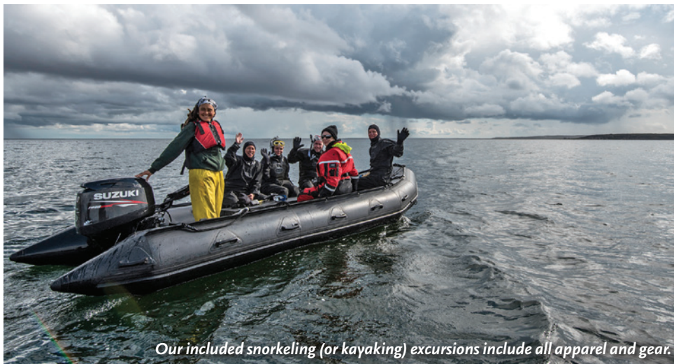
Our included snorkeling (or kayaking) excursions include all apparel and gear.