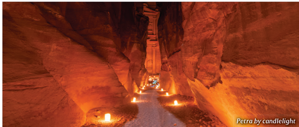
Petra by candlelight

We'll head north to beautiful Galilee ☞. First is Capernaum, a 2nd Century synagogue that illuminates the religious life of Jesus' time. We'll also visit the traditional house of Saint Peter and go on to Tabgha, the site of the 'loaves and fishes' where the third