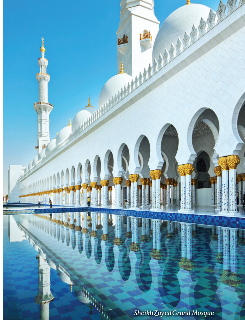
Sheikh Zayed Grand Mosque

resurrection appearance also reportedly occurred. The Mount of Beatitudes, nearby, is the site of the Sermon on the Mount overlooking the rolling countryside and the distant Golan Heights. We'll end with a ride across the gentle waters of the Sea of Galilee.