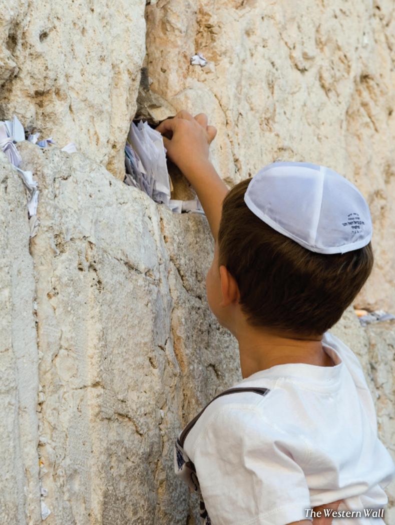
The Western Wall