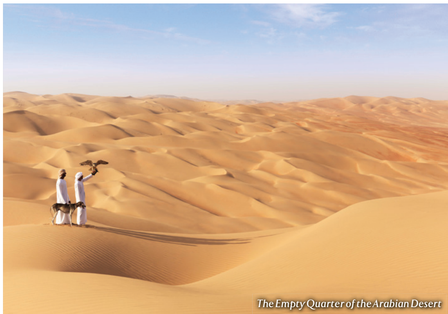
The Empty Quarter of the Arabian Desert