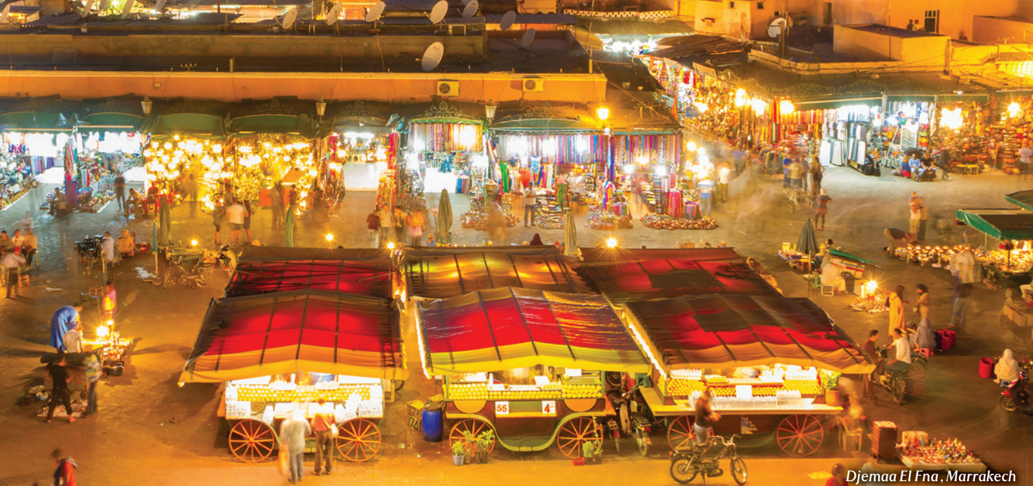
Djemaa El Fna, Marrakech