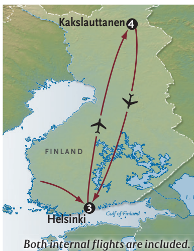
Both internal flights are included.