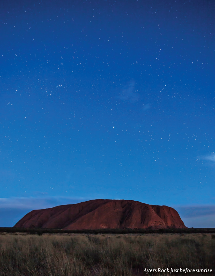
Ayers Rock just before sunrise