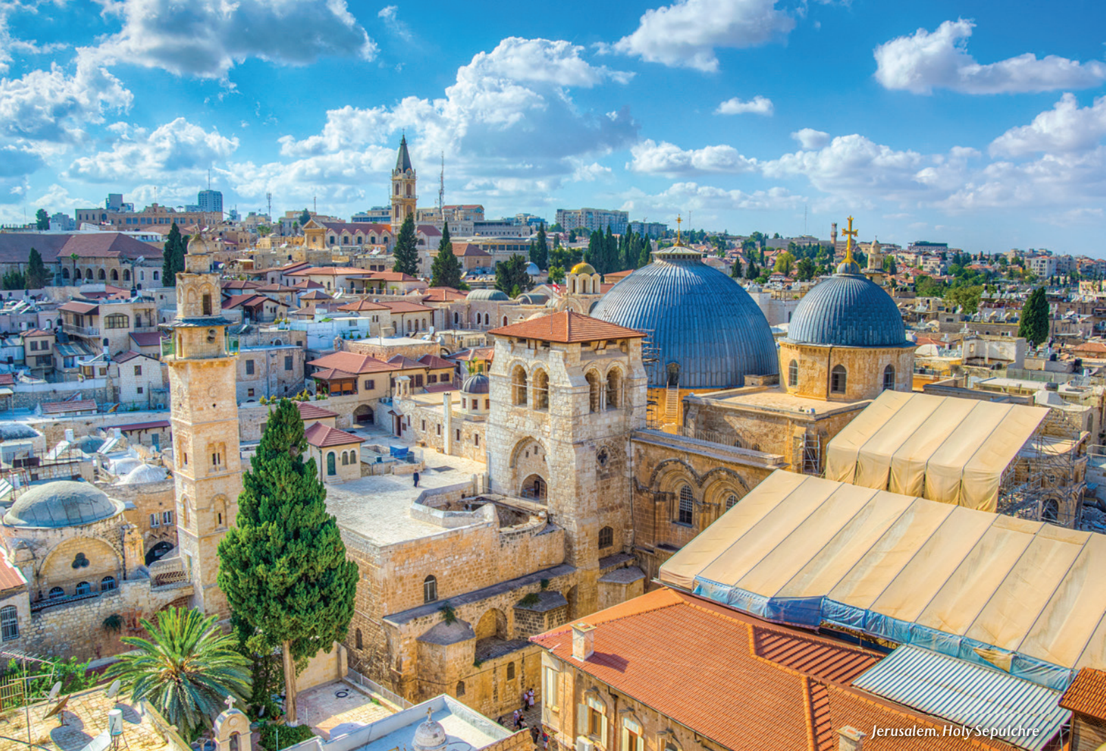
Jerusalem. Holy Sepulchre