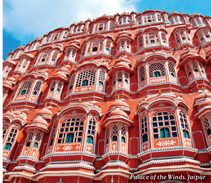
Palace of the Winds, Jaipur