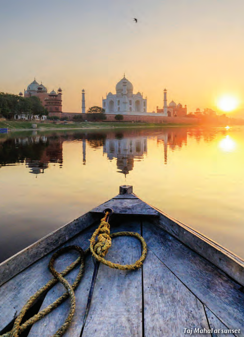
Taj Mahal at sunset