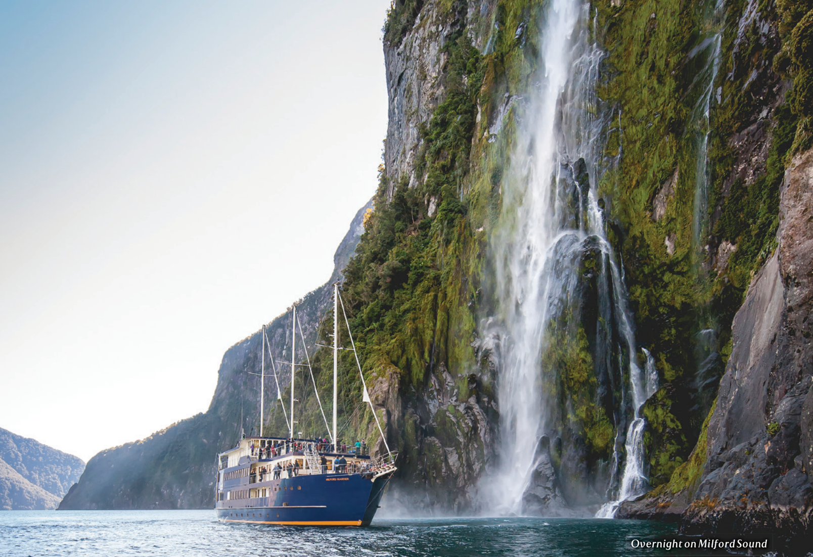
Overnight on Milford Sound