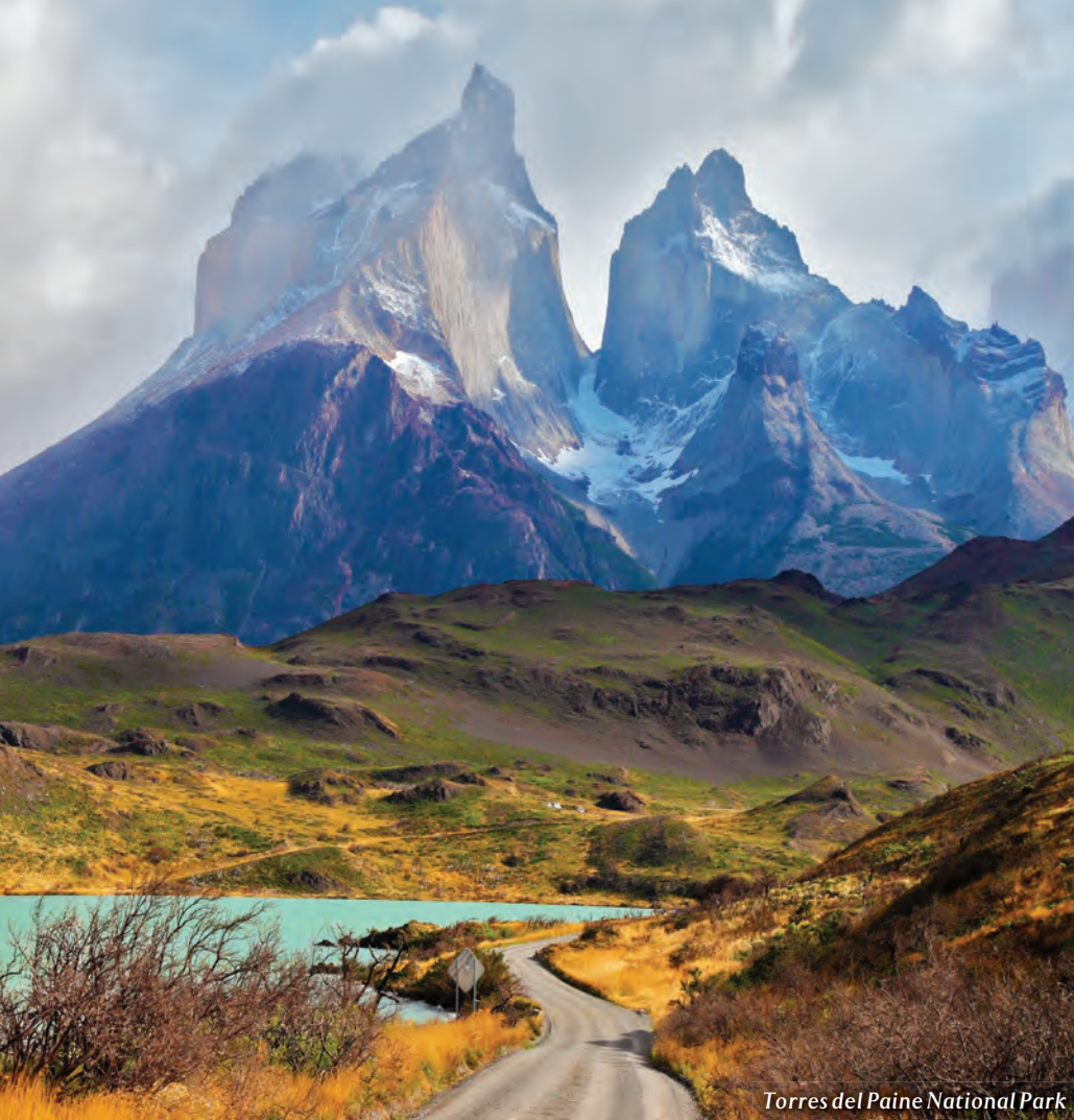
Torres del Paine National Park