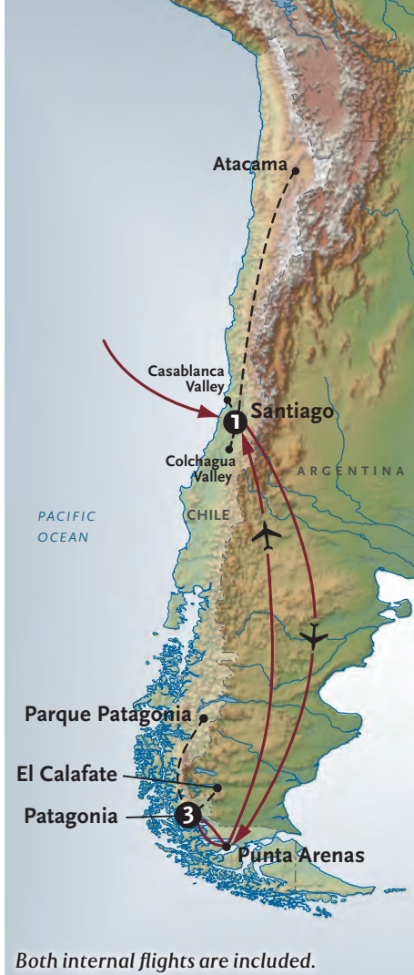
Both internal flights are included.