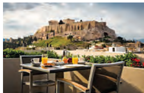
ATHENS - ATHENS GATE HOTEL You'll love our hotel's terrific location in the historic district near the Temple of Zeus.