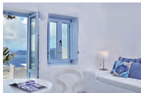
SANTORINI - ASTRA SUITES Perched high above the Aegean, you'll enjoy a Classic Junior Suite with a private terrace and sea view.