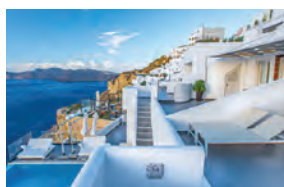
SANTORINI - SECRET BOUTIQUE HOTEL Your spacious suite boasts a private balcony with hot tub and breathtaking views.