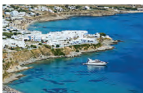
MYKONOS - PETASOS BEACH RESORT & SPA Your deluxe room at this inviting beach resort offers views of the Aegean Sea.