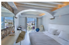
MYKONOS - SEMELI HOTEL A+R guests enjoy a Superior Sea View Room at our luxury boutique hotel ideally located in the heart of town.