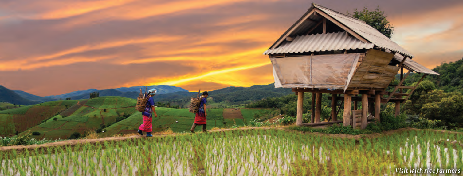
Visit with rice farmers