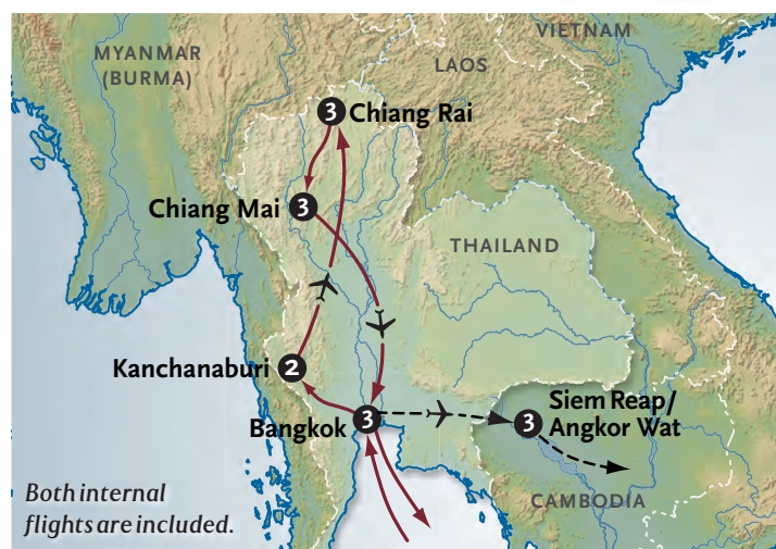
Both internal flights are included.